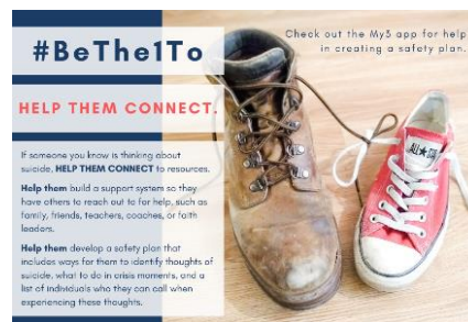
Message #4 – Be the One to HELP THEM CONNECT