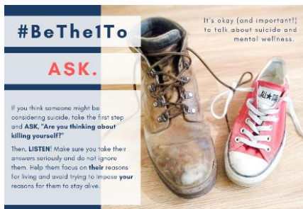
Message #1 – Be the One to ASK

The KMCHC has designed a series of social media posts based on the #BeThe1To's 5 Action Steps for Helping Someone in Crisis . Throughout the months of May and September, post the graphics on your social media platforms. Feel free to customize the messages to include any resources, support services, treatment providers, and suicide prevention or mental health training opportunities in your community!