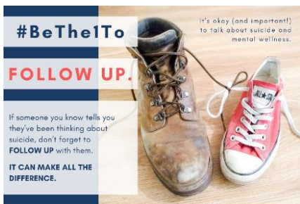
Message #4 – Be the One to FOLLOW UP