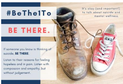
Message #3 – Be the One to BE THERE