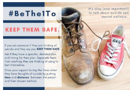
Message #2 – Be the One to KEEP THEM SAFE