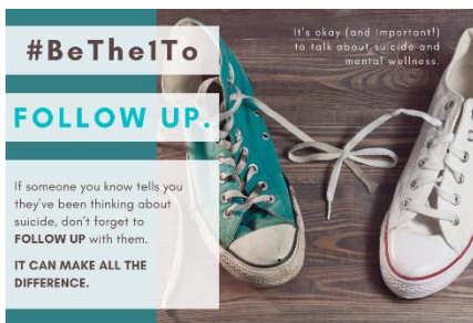
Message #4 – Be the One to FOLLOW UP