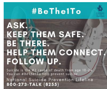
Message #6 – Be the One FIVE STEPS

If you or someone you know is struggling with thoughts of suicide, call the Lifeline at 1-800-273-8255 (TALK). Additional information and suicide prevention resources can be found at: http://bit.ly/KMCHC_SuicidePrevention