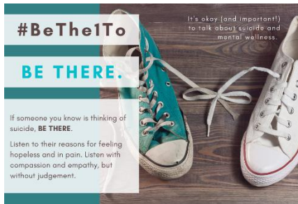
Message #3 – Be the One to BE THERE