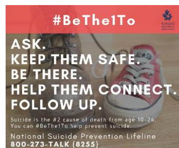
Message #6 – Be the One FIVE STEPS