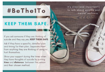
Message #2 – Be the One to KEEP THEM SAFE