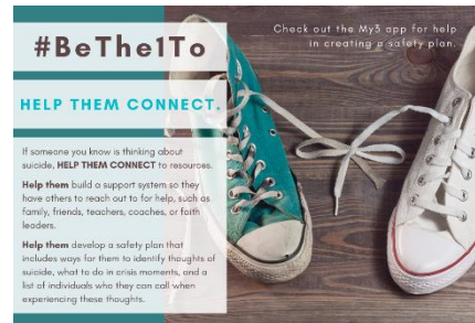
Message #4 – Be the One to HELP THEM CONNECT